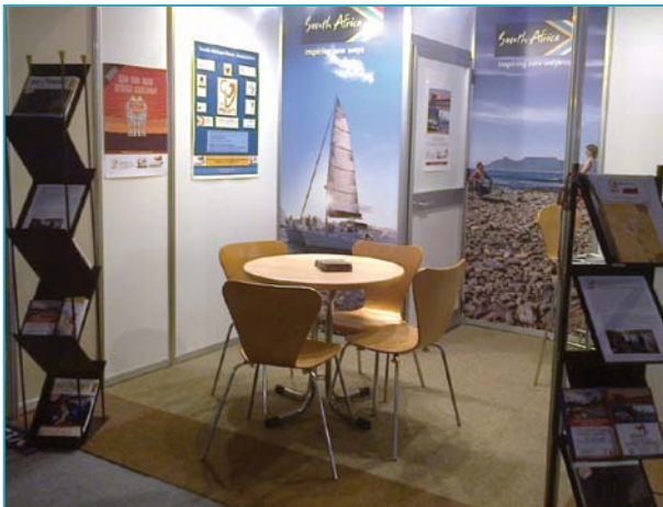
Thanks to the support of SA Tourism, the SA Heart stall at the ESC congress appeared both professional and inviting.

To underline the increased collaboration between the societies – SA Heart being an Affiliated Member of the ESC – the ESC afforded SA Heart a full booth at the recent ESC congress, rather than merely a display panel amongst the other affiliated member countries in a combined exhibition area. SA Tourism came on board and supported designing and print of the booth panels, paying for courier costs and providing South African Tourism DVDs and maps for our stall. The result was an inviting, professional presentation. Pioneer foods kindly sponsored some Safari nuts & raisin packages which we complemented with some packets of fruit dainties to hand out as snacks to the congress goers.