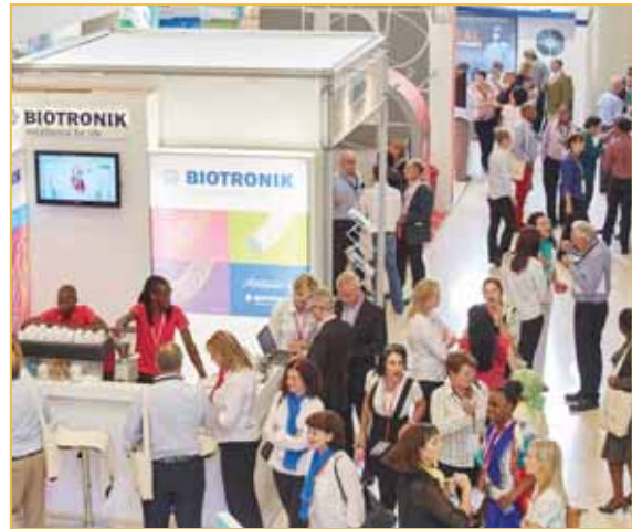
Exhibition of industry partners