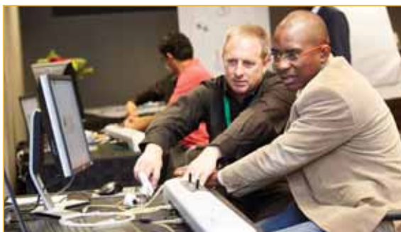
Delegates try out the radial simulator

One of the Course highlights was a special focus on radial PCI, with 2 workshops on each day dedicated to how to start a radial programme, and the tips and tricks needed to succeed with radial PCI. The workshops were sponsored by Terumo, who complemented them with a model of radial access and a radial simulator which proved to be an irresistible key attraction.