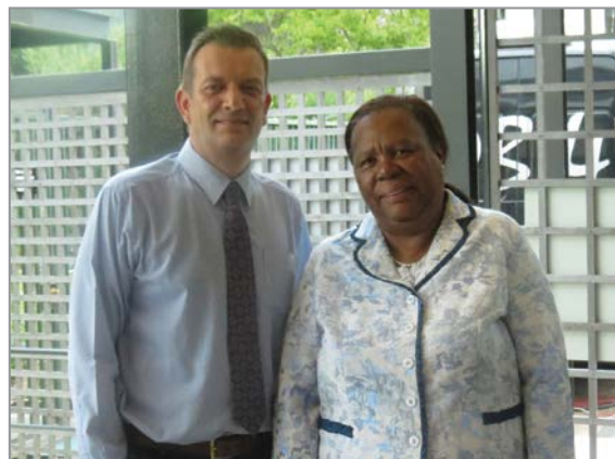
Prof Hans Strijdom and Minister of Science and Technology, Naledi Pandor, during a high-level event at which the EndoAfrica project was introduced.

Baseline investigations will include measurement of endothelial function using flow mediated dilatation, screening for hypertension, diabetes, obesity, dyslipidaemia and smoking and measurement of air pollution exposure. Serum will be stored as nested case-control design for subsequent analysis of endothelial dysfunction biomarkers. Baseline investigations will be repeated at 18 months, and provision will be made for additional air pollution measurements to allow for temporal changes. Epidemiological studies are underpinned by animal and in vitro investigations in which the direct vascular and endothelial effects and mechanisms of first line ART regimens will be explored. This study will provide novel data regarding the overall prevalence of endothelial dysfunction, and effects of HIV infection and ART on vascular endothelial function in the study population. Information will be gained on the prevalence of traditional cardiovascular risk factors, and will reveal whether a relationship exists between air pollution exposure and endothelial dysfunction.