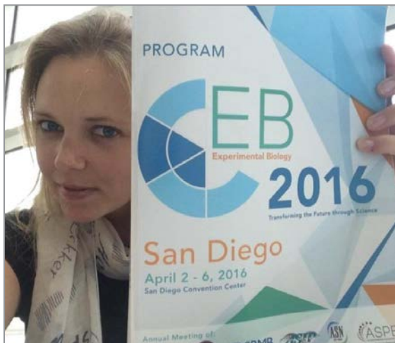
Abstract programme from the conference

As fate would have it, my presentation was on the last day of the conference! Seeing the large number of attendees